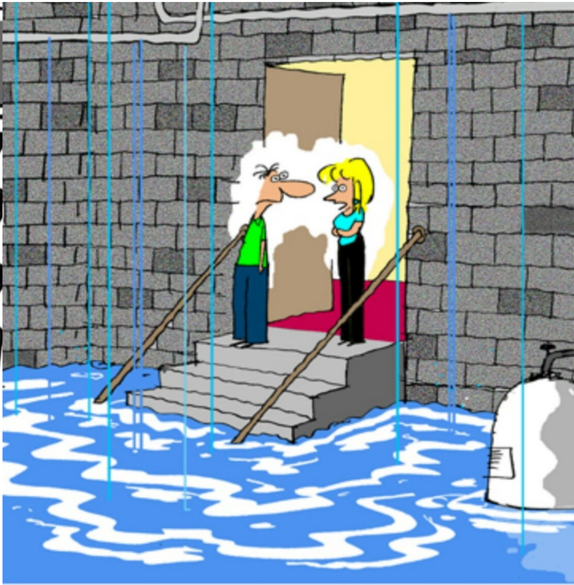
"No, you can't list this as an 'indoor pool.'"