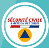
Direction Generale de la Securite civile et de la Gestion des crises - FRANCE -