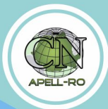
National Centre Apell for Disaster management - ROMANIA -