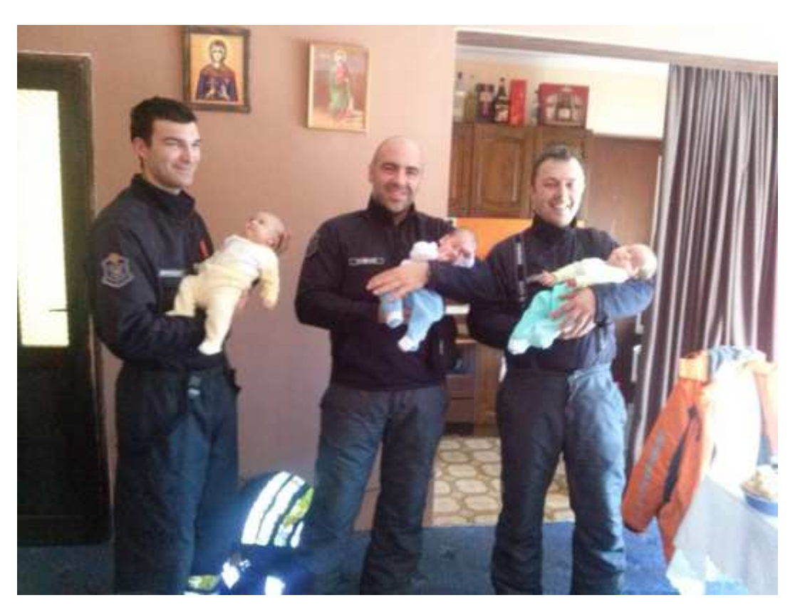
Officers of the Sector for Emergency Management on motor sleds arrived on time. Necessary baby food for triplets from the village of Gornja Rogatica (municipality of Bačka Topola) has arrived.