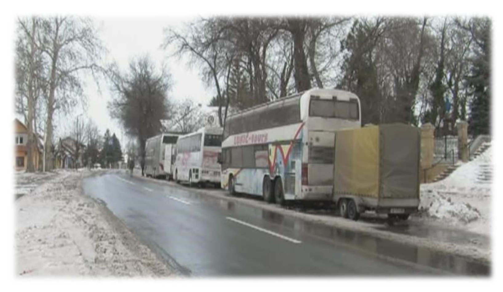
Preparing buses with passengers to continue the trip in organized convoys