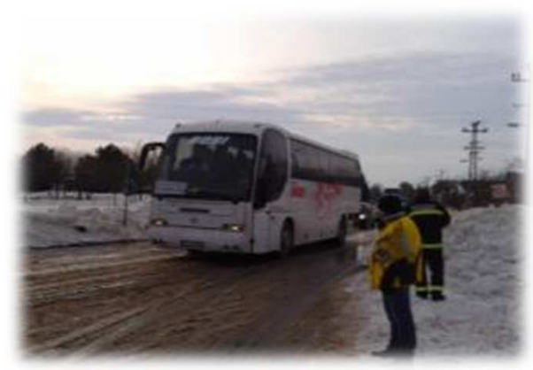
Organized return of the vehicle to the highway (in convoys)