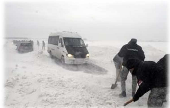
Release of the stuck vehicles on the highway