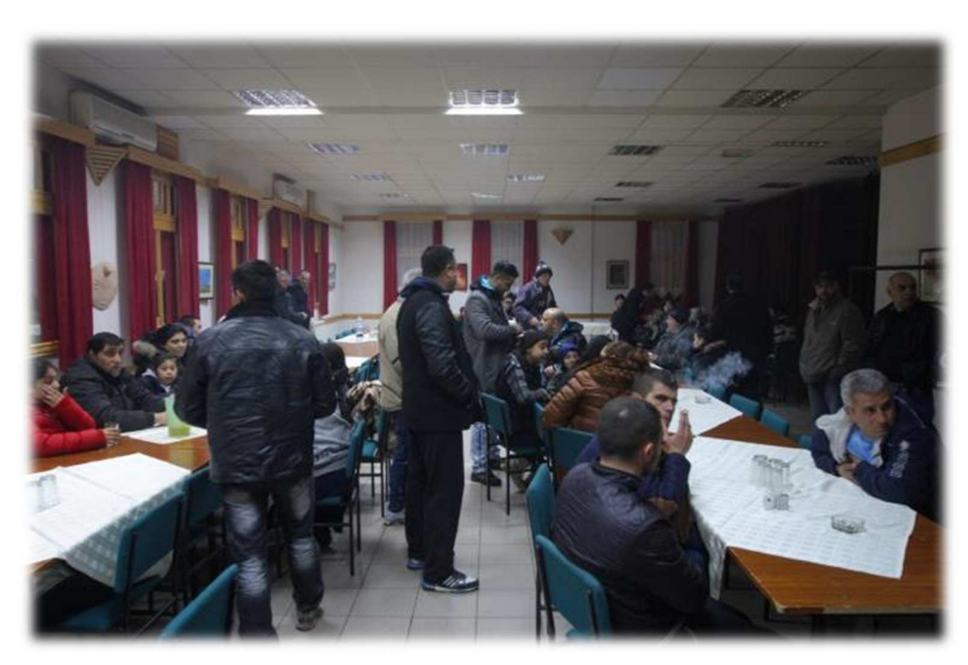
Evacuated passengers in the premises of Volunteer Fire Association "Feketić" in Feketić