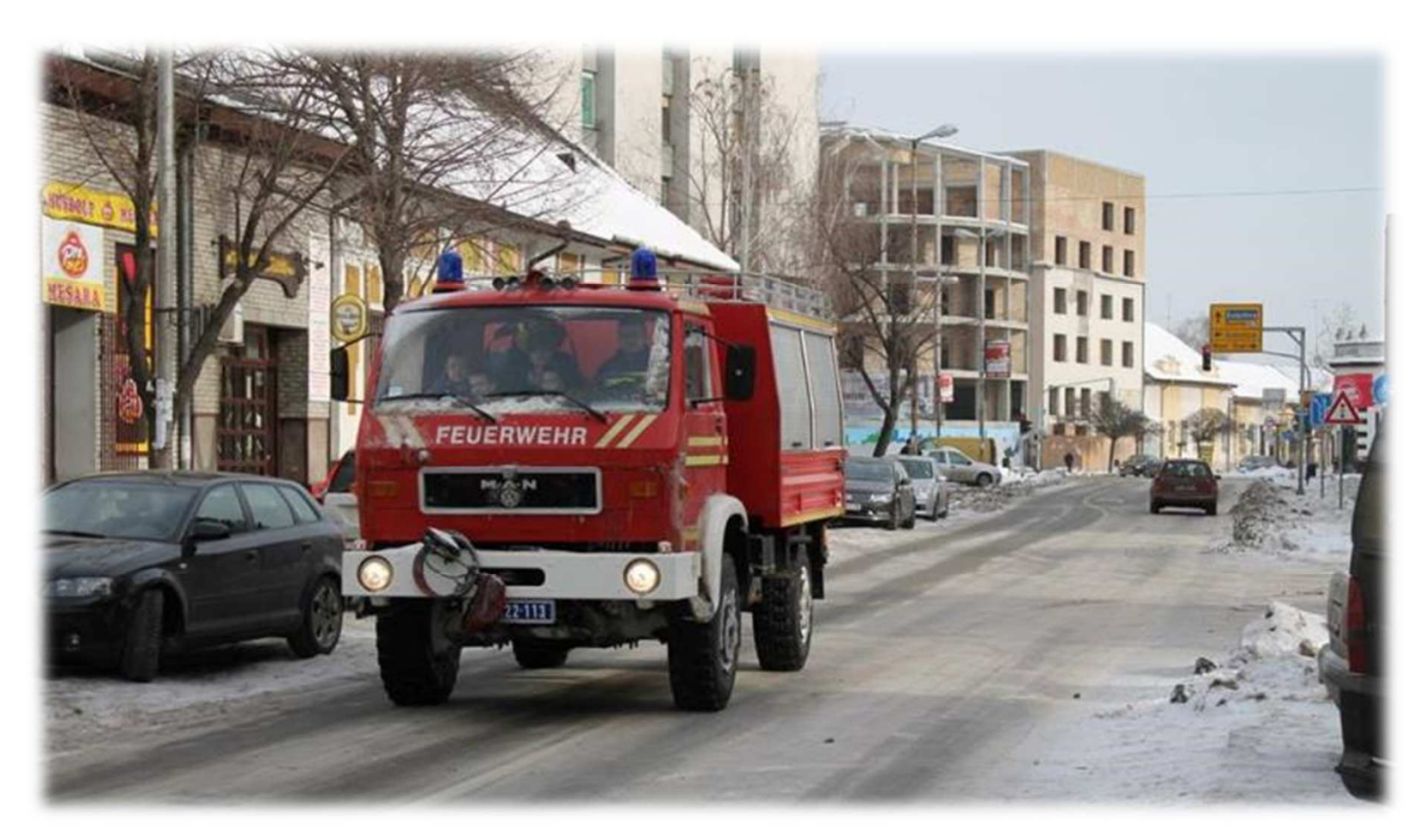
Evacuation of passengers by fire - rescue vehicle