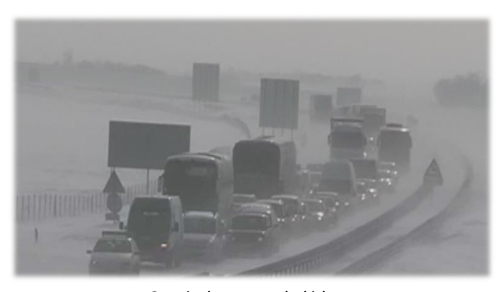
Organized convoy on the highway