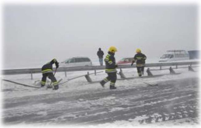
Cutting the protective fence on Corridor 10 for the purpose of pulling and evacuating vehicles and passengers