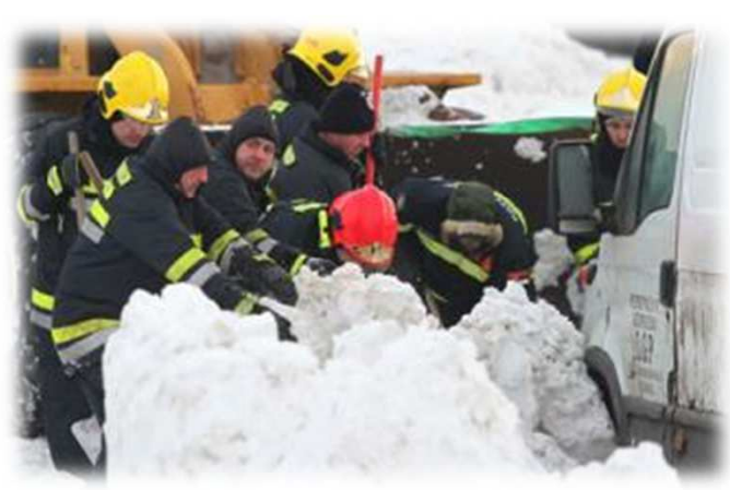
Pulling and evacuating the stuck_vehicles into the passable lane of the highway