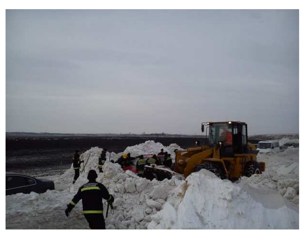
All available cleaning units on the highway were cleaning the Bačka Topola Loop and the access roads to Bačka Topola