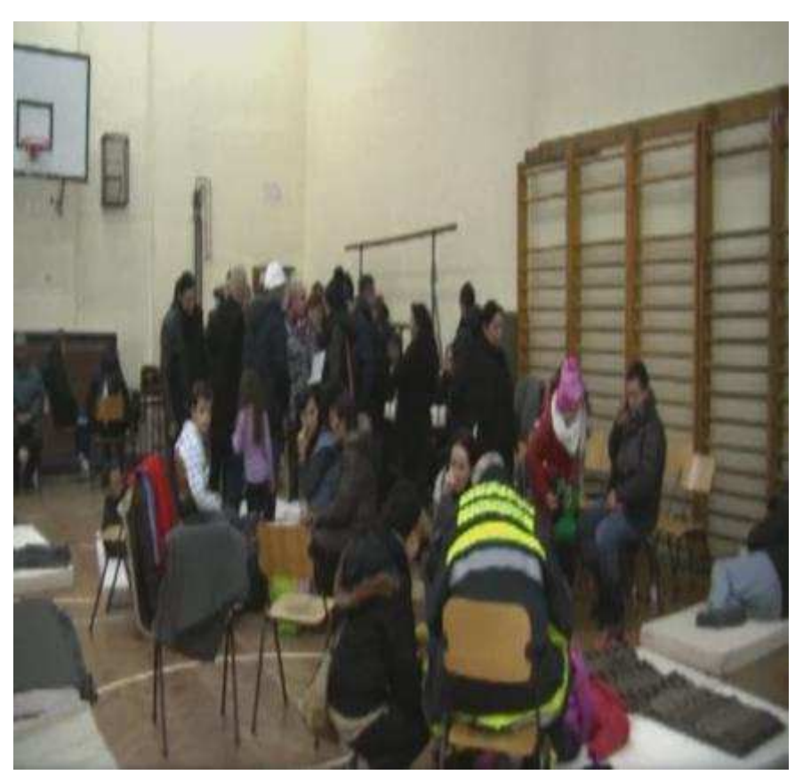
Gymnasium of the Elementary School "Čaki Lajoš" First arrived evacuated passengers from Corridor 10