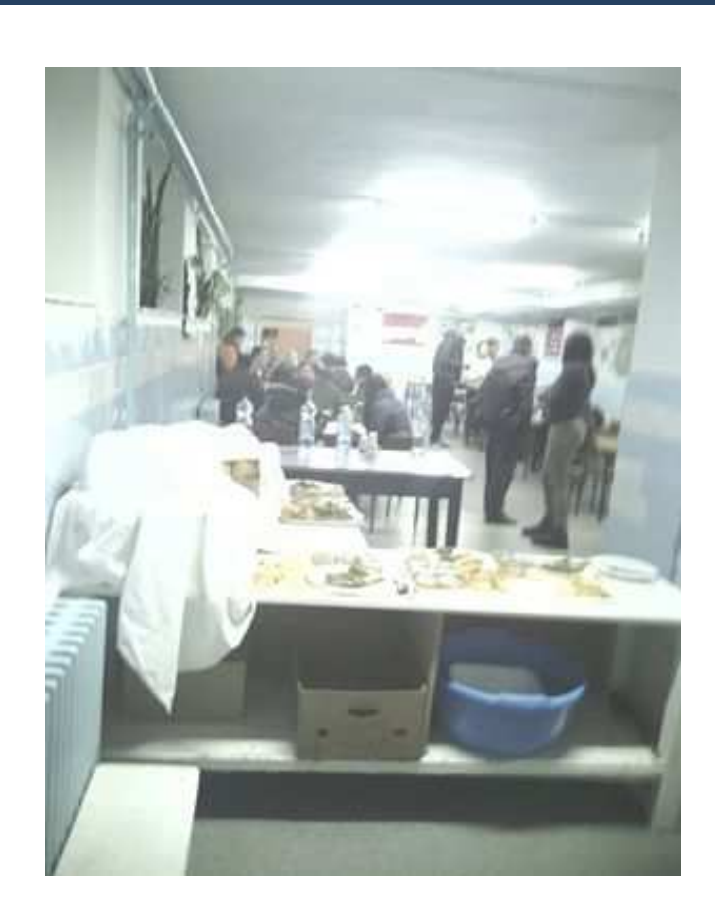
Kitchen of the Elementary School